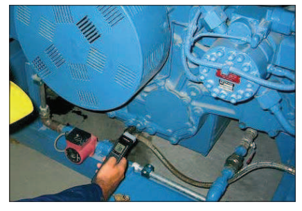
Mechanical maintenance Observe temperatures of motors and drives, bearings and valves. Gather temperature data of heating and ventilation components. Check furnace performance and steam distribution systems.