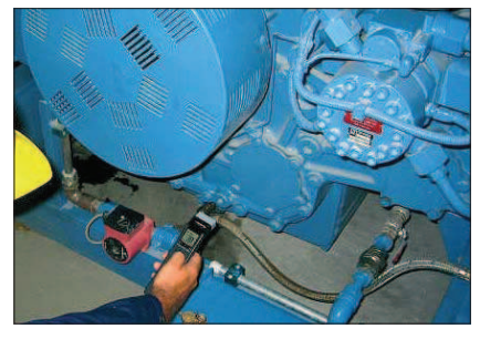
Mechanical maintenance Observe temperatures of motors and drives, bearings and valves. Gather temperature data of heating and ventilation components. Check furnace performance and steam distribution systems.