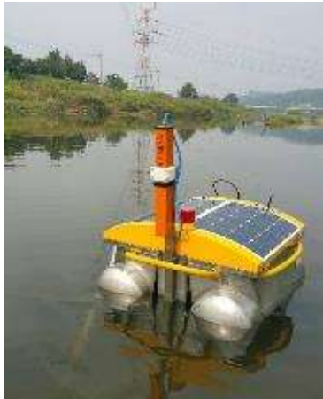
KECO (Korea Environmental Corporation) Gyeonggi Government, River monitoring, Yangju and Pocheon cities