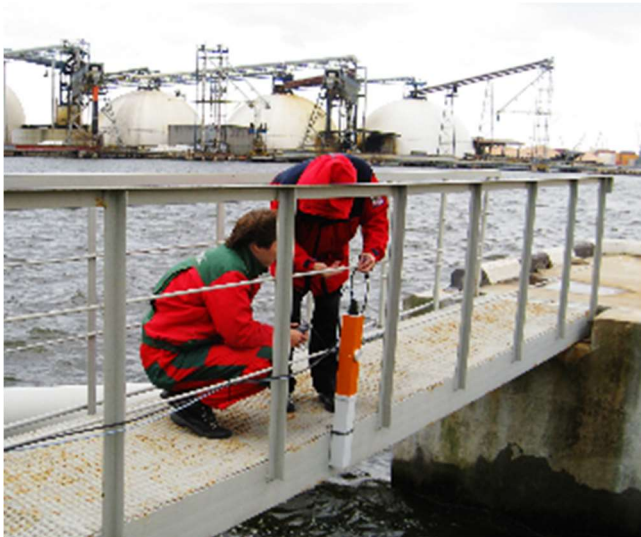
Freeport Of Riga, port area monitoring (7 unit network), Riga