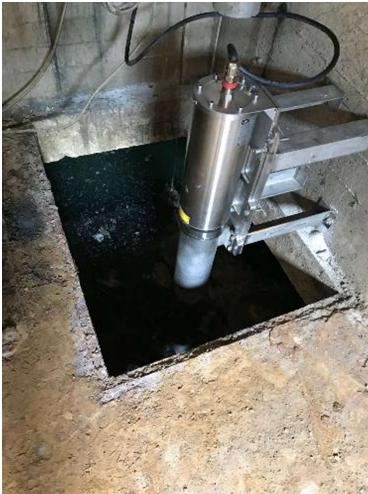
Fuel Depot monitoring water cistern jet fuel, Oslo