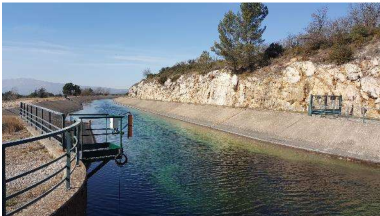
SCP – Municipal Canal

Undisclosed, lift station in wastewater treatment plant, Auriol Undisclosed, entry to water treatment plant