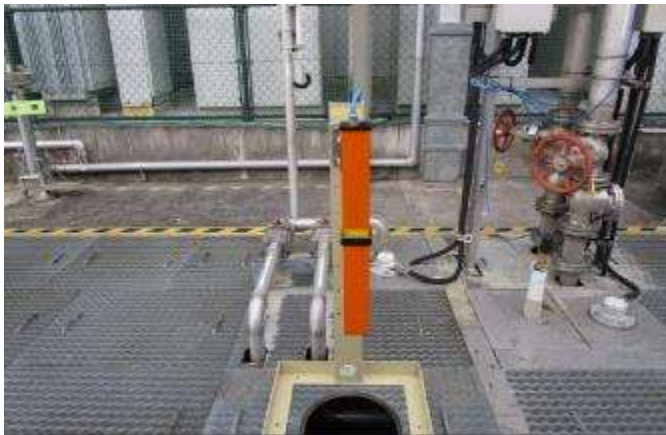
Undisclosed, Chemical (Ink) manufacturing factory, Oil in waste water discharge, Shiga Prefecture