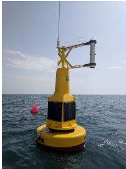
Power and desalination plant, offshore buoy