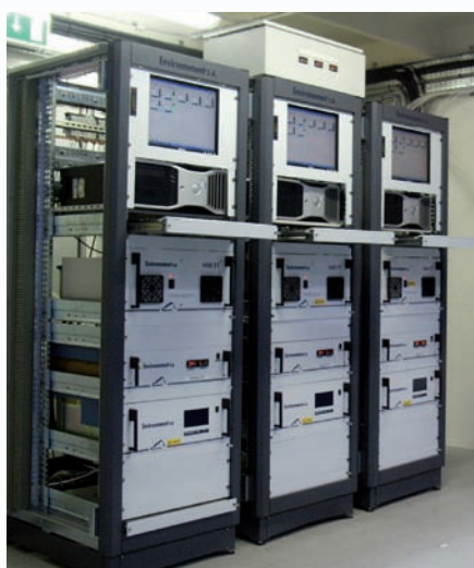
MIR FT rack cabinet

With the emissions limits tightening and new gases being introduced, this instrument allows future gas upgrades, providing the solution for today and what may happen tomorrow. Designed to operate under legislation such as 2000/76/EC (WID) and 2001/80/EC (LCPD), The MIR-FT offers maximum availability and complete compliance with QAL 1 of EN14181 & EN15267-3.