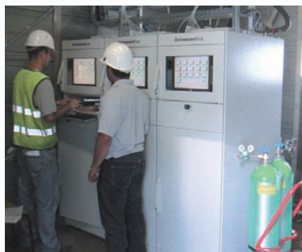
MIR FT mounted in air conditioned enclosure